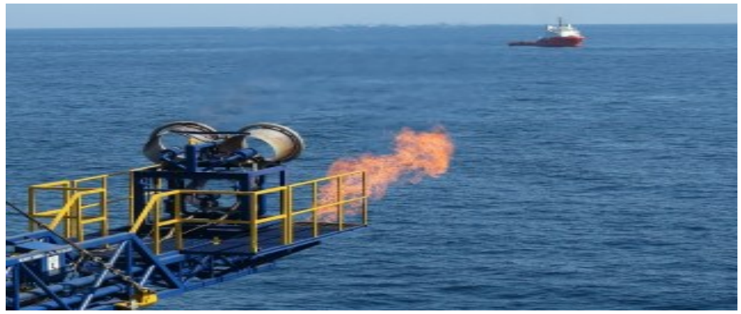
Fig. 3. Flame of methane gas burning during the operation test of methane hydrates made by Japan in the Pacific Ocean

The test lasted for 6 days and 120,000 m<sup>3</sup> of methane was produced. This achievement of Japanese specialists comes as a result of their numerous participations to joint projects with the US and Canada. I myself had lengthy discussions with two JOGMEC representatives, who came to Oklahoma University to study the patent of my invention and to negotiate his eventual purchase.