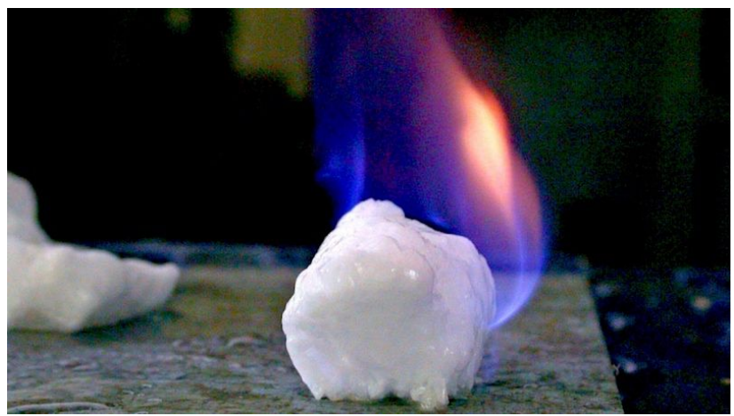
Fig.2. Example of flammable ice

Methane hydrate or "Flammable ice" constitutes an important fuel source. Methane is the result of anaerobic bacteria's action on dead organisms, bacteria decomposing organic substances into smaller molecules. Marine organisms live up to several hundred meters deep, which explains the absence of methane hydrate at depths greater than 2000 m. Water and methane do not chemically react with each other and in areas where the instantaneous freezing conditions of the Water are present, spherical structures are formed from 20 or 24 water molecules that catch trapped inside the molecules of methane gas. A decimeter cube hydrate of methane contains 168 liters of methane (gas), (figure 2).